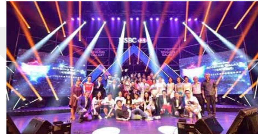
汇丰银行歌手大赛 HSBC Singing Galaxy

In August 2016, HSBC China held a one-month OPEN coaching initiative. Through bi-weekly mental health newsletter, expert consultation hotline, health lectures and lunch break activities, the bank helped employees effectively relieve pressure.