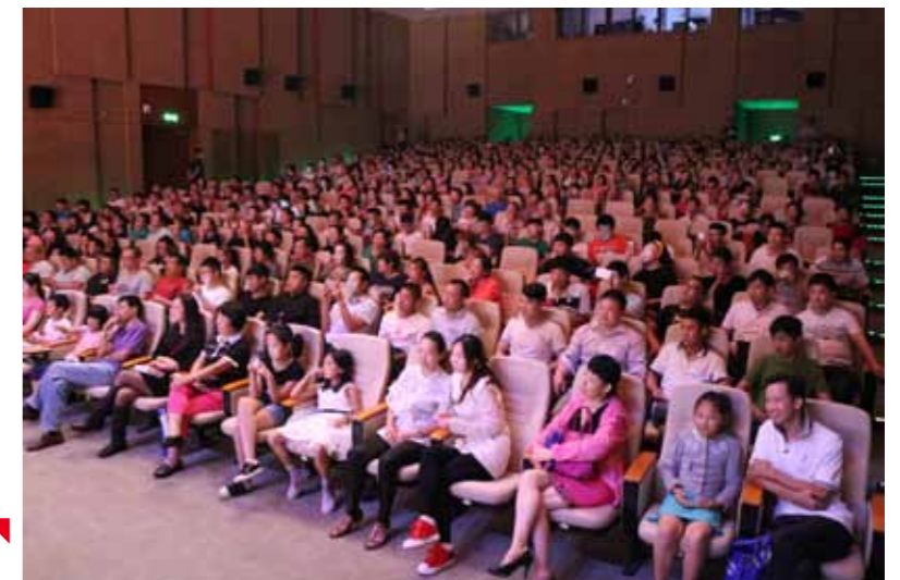
北京市海淀区北部文化中心现场观众观看表演 Audience watch the performance at Haidian Northern Cultural Centre of Beijing.

In 2012, HSBC started to provide funds to meet migrant workers' demand for financial literacy education. In the form of innovative drama, it set a precedent of providing financial literacy education for 10,000 migrant workers.