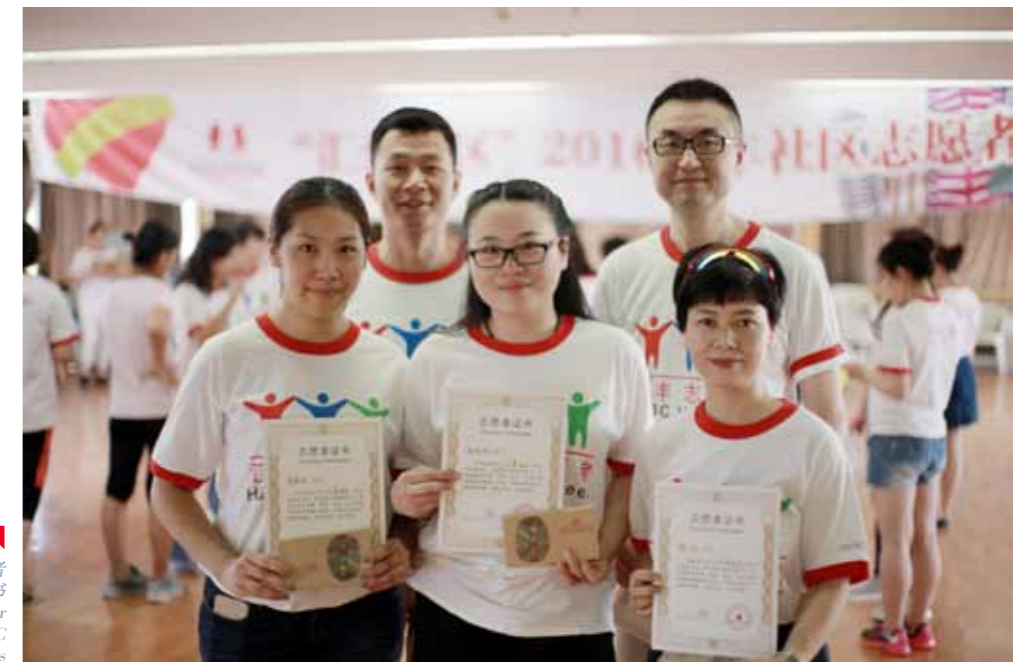
社区公益伙伴为汇丰上海志愿者颁发证书 Community charity partner presents employees from HSBC Shanghai with certificates