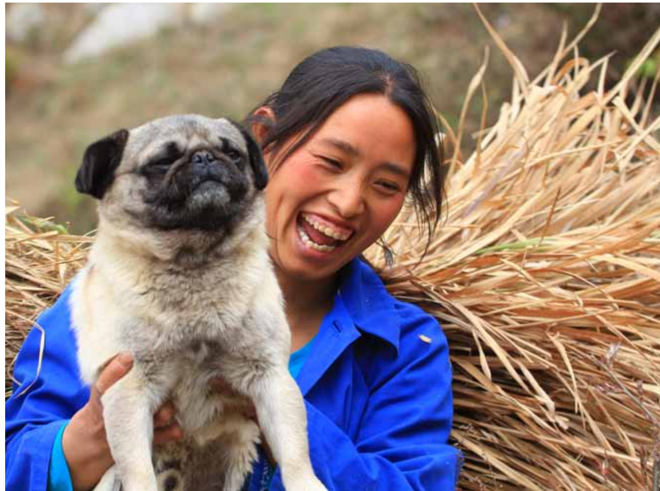
关坝村村民通过生态农业提升收入，保护环境 Villagers at Guanba Village have increased incomes and conserved the environment through eco-agriculture.

In the upper reaches of the Yangtze River, HSBC teams up with Shanshui Conservation Centre and works with the forestry protection authorities in Sichuan and Gansu provinces to protect headwaters and forest land and promote the ecological industry in local communities. In 2016, through conservation and development practices in pilot communities, more than 300,000 hectares of forests for water conservation were effectively protected. Each year, nearly RMB20 million of ecological compensation fund is effectively utilised, influencing over 58,000 people in 100 communities and protecting drinking water safety for one million people in Chengdu. Pilot experience from Guanba Basin Nature Reserve of Pingwu County has been included in the List of Key Reform Pilot Typical Cases and Experience Promotion in Sichuan.