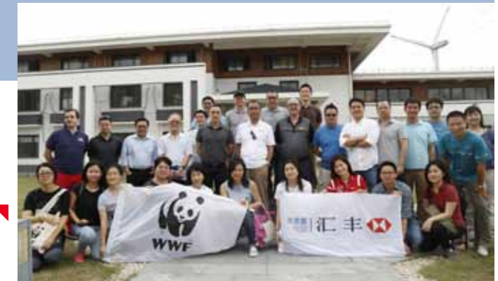
汇丰银行(中国)有限公司的高管在上海崇明岛参加环保志愿服务，感受生态环境面临的挑战。 Senior management team of HSBC China participated in volunteer service at Shanghai Chongming to experience challenge and threat faced by the ecological environment.

This is the issue of the green bonds with the most currencies in Asia and the world's largest circulation, and also the first green bonds in euro issued in Asia.