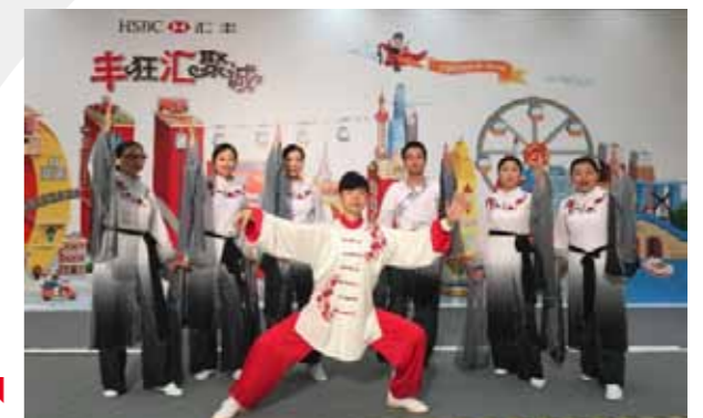
“慢生活，从太极开始” Slow Life Starts with Tai Chi