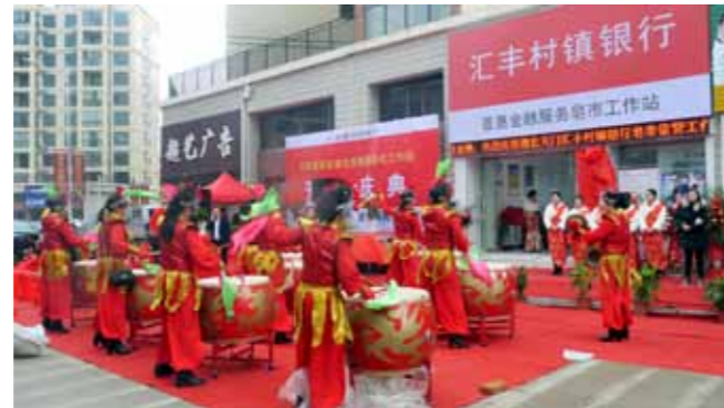
2016年11月, 首家标准化普惠金融网格化工作站在湖北天门皂市揭幕, 建立高效率、低成本、标准化的网点下沉模式 In November 2016, HSBC's first standardized grid financial service station for rural inclusive finance was inaugurated at Tianmen City of Hubei, establishing an efficient low-cost and standardized outlet operating model