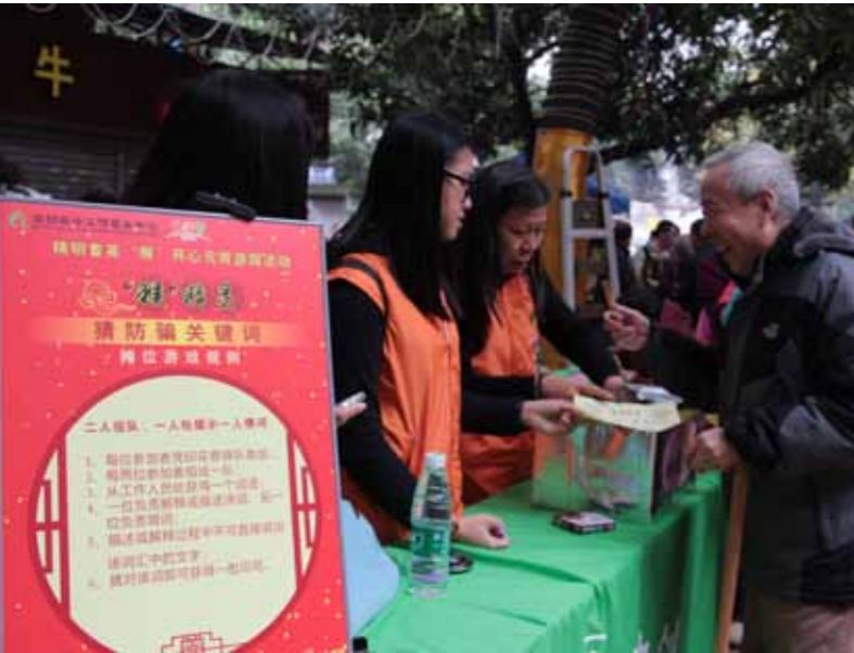
社区老人参加项目宣传活动摊位游戏 Elderly people in the community play a game at a publicity booth for the programme.

SMART SENIORS-GUANGDONG ELDERLY PEOPLE FINANCIAL LITERACY EDUCATION PROGRAMME