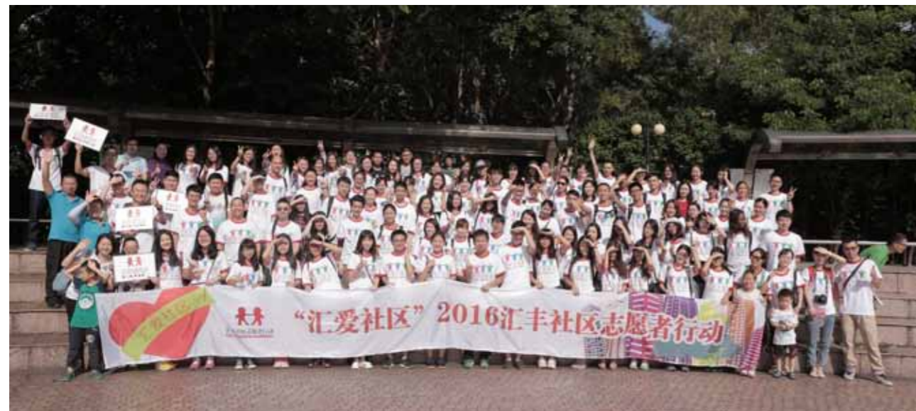
2016“汇丰社区志愿者行动”深圳站百余名志愿者参与服务活动 More than 100 volunteers in Shenzhen take part in the 2016 Staff Community Service Programme

In 2016, HSBC's annual community service programme - HSBC Staff Community Service Programme became a routine commitment, and HSBC kept providing volunteering services for local communities. HSBC's 33 branches and 12 rural banks across China carried out a total of 162 community service activities, and 2,900 employees took part in the activities, contributing 15,671 hours of volunteering services. These figures were up by 88%, 57% and 70% respectively from the previous year.