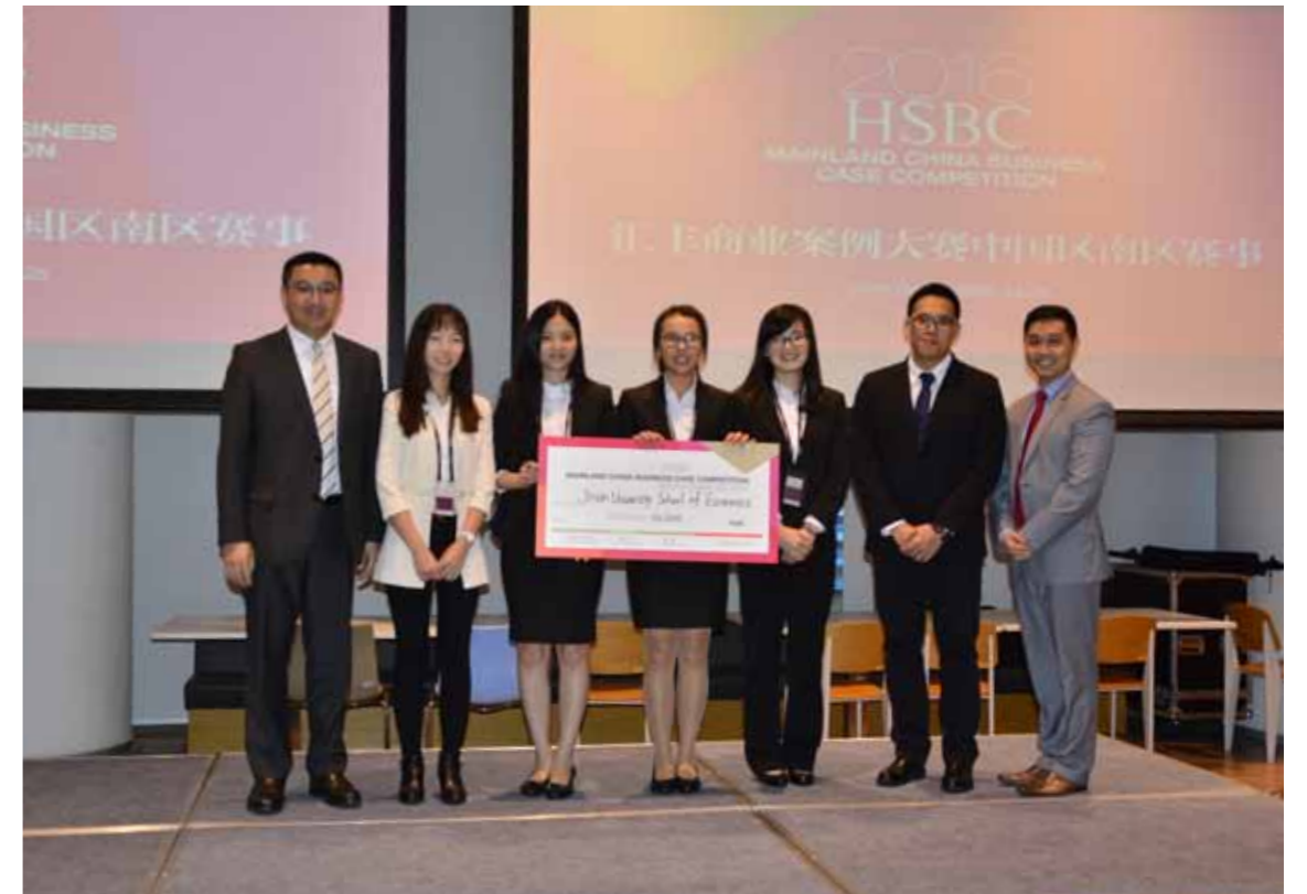
2016汇丰商业案例大赛比赛现场 The onsite event of 2016 HSBC China Business Case Competition

In 2016, the HSBC China Business Case Competition invited a total of 20 teams from 16 universities. The School of Economics of Jinan University and the Guanghua School of Management of Peking University won the championship in the southern and northern regions respectively. The latter took part in the Asia-Pacific competition in Hong Kong on behalf of the Chinese mainland.