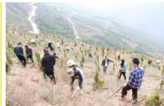
汇丰员工和项目试点区域的熊耳村村民一起进行幼林地补植 HSBC volunteers work with villagers at Xionger Village to replant trees in the sapling forest land.