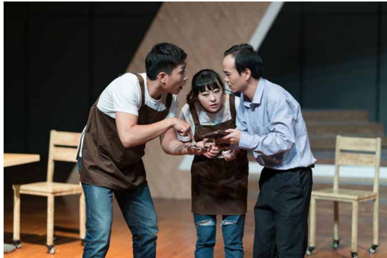
国家大剧院《乌托咖啡馆》演出剧照 Photo of Utopian Café performance at the National Centre for the Performing Arts.