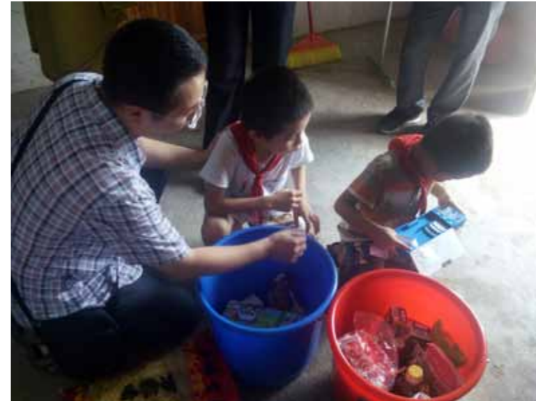
钦州市检察院工作人员为服刑人员子女送去生活及学习用品 Employees of Qinzhou Procuratorate brought living and school supplies for prisoners' children.

PRISONERS' CHILDREN SUPPORT AND DEVELOPMENT PROGRAMME IN GUANGXI