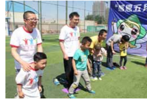
唐山分行感恩母亲节活动,志愿者和孩子及家长一起开心地做游戏,每一个人都笑容满面 HSBC Tangshan celebrates the Mother's Day. Volunteers and kids play games happily together.