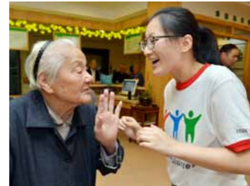
宁波分行志愿者在活动中为老人耐心进行讲解 A volunteer with HSBC Ningbo supports an old lady in an activity