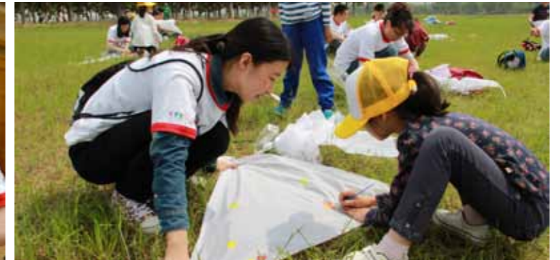
苏州分行的志愿者与社区流动儿童制作风筝 HSBC Suzhou Branch staff volunteers made kites with migrant children in the community