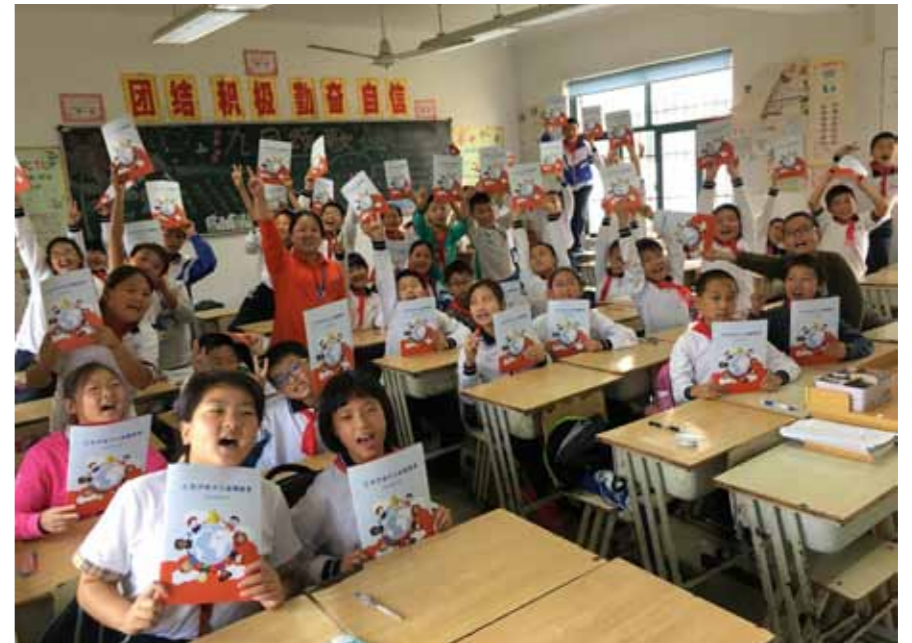
华东师范大学附属杨行小学的同学获赠《少儿金融教育》教材 Students from Yanghang Primary School affiliated to the East China Normal University are presented with the textbooks for Financial Literacy Education for Children.

2016年，汇丰资助的“上海市社区青少年金融教育公益项目”以参与式的教学模式，开设少儿金融理财课程，帮助上海市上万名8-14岁的小学和初中生学会计划用钱，提高财商和理财能力。