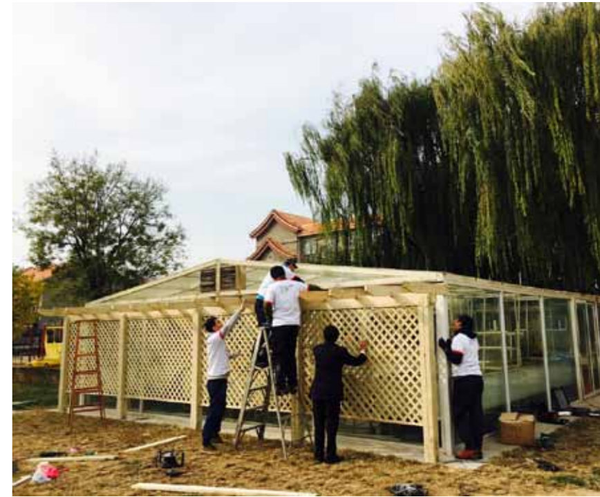
志愿团队为孩子们搭建葡萄架 Volunteers set up grape trellis for local children