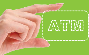
1. Debit Card